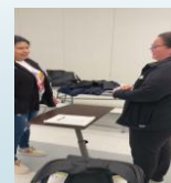
Student Dialog Practice