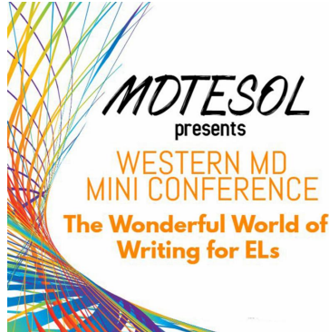
Literacy Council Participates in Western Maryland TESOL Conference