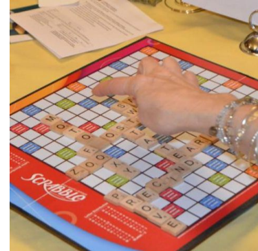
4th Annual Scrabble® Mania for Literacy is a Success!