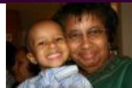
Grandparent finds reading to grandchild fulfilling.

“It is so rewarding to see a student be able to help their child with their homework or read a bedtime story to their grandchild.”