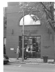
Literacy Council of Frederick County 110 E. Patrick St.

Imagine a summer without summer reading. Many adults cannot read, but you can help!